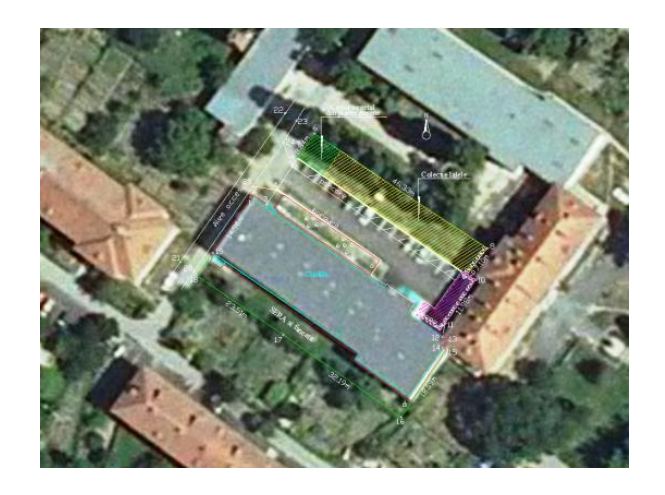
Figure 3. Dendrofloral map