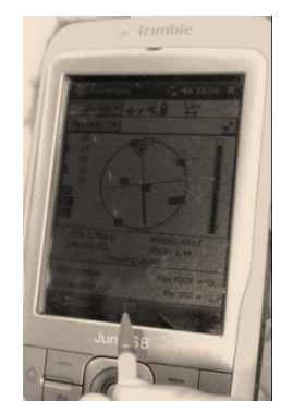
Figure 1. GPS Trimble Juno SB

types of software, the TerraSync software was used. To complete mapping all data was transferred to specialized CAD software.